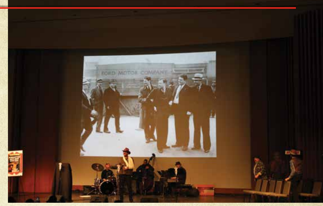
"The Forgotten Man's Radio Hour" performs at the "We Built These Cities" weekend.

Building the Engine: Auto & Labor, 1932-1937 was a yearlong recognition of the impacts of a series of major events that shaped the labor movement in the United States. Throughout 2017, MotorCities collaborated with the Michigan Labor History Society and other community partners to present programming including lectures, tours, musical tributes and a blog in order to highlight these anniversaries.