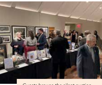
Guests browse the silent auction.