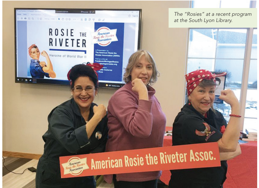
The "Rosies" at a recent program at the South Lyon Library.

Received a grant to support a year of public programming discussing the significance of women's contributions to winning World War II.