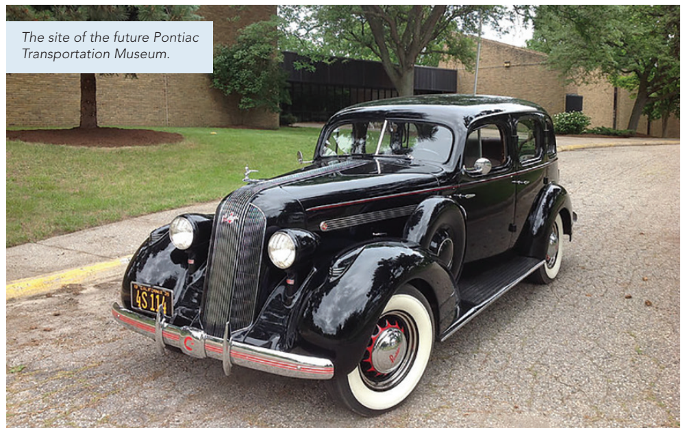
The site of the future Pontiac Transportation Museum.

Pontiac Transportation Museum: Received a grant to support the construction of an orientation theatre and other facility upgrades for the soon-to-open attraction.